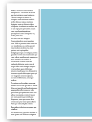
2/3 page 4.958" x 10.125"