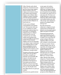
1/3 page 2.292" x 10.125"