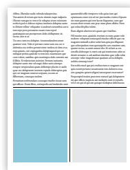
1/4 page 3.625" x 4.875"