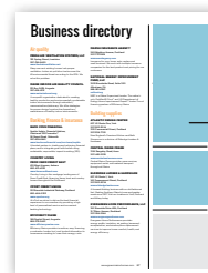
1/6 page 2.292" x 4.875"