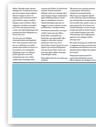
1/2 page 7.625" x 4.875"